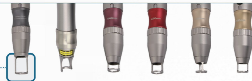
Fractional Hand Piece (1064nm) Zoom Hand Piece (2-10mm Standard) Dye Hand Piece (660 / 650 / 595 / 585nm)

The fractional hand-piece uses fractional beams (360 spots, 16x16mm) to allow higher fluence (J/cm2) compared to the bulk mode hand-piece, allowing it to effectively destroy various pigmentations which were hard to treat before.